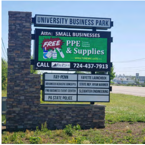
Fay-Penn's University Business Park sign along Rt. 119 provides COVID-19 business information.